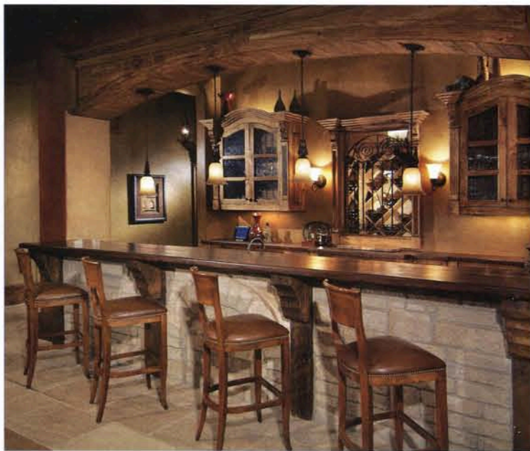
Top right: The homeowners utilized their own bar stools in the terrace-level BAR , making it a comfortable spot to play bartender or sommelier. The rich wooden cabinets by Coventry Designs accent the original brick and tile work created by the builder. The Indigo Muse of the walls was created with faux finishes.