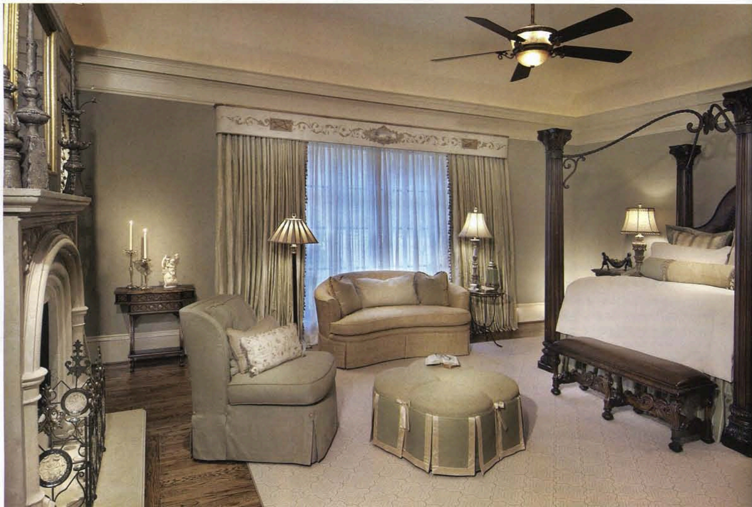
Bottom: Fit for a king and queen, the regal MASTER BEDROOM blends comfort with elegance. The four-poster bed is dressed in custom-designed bed linens by Basils, accented by a center lumbar pillow, bed skirt and Euro shams designed by Beacon Hill. The dainty chair by Henredon and the coordinating love seat from TRS Furniture create an inviting sitting area. The delicate ottoman was custom-designed by Beacon Hill Gallery, Dogwood and Fabricut, and the luxe window treatments are by Robert Allen and Stout.