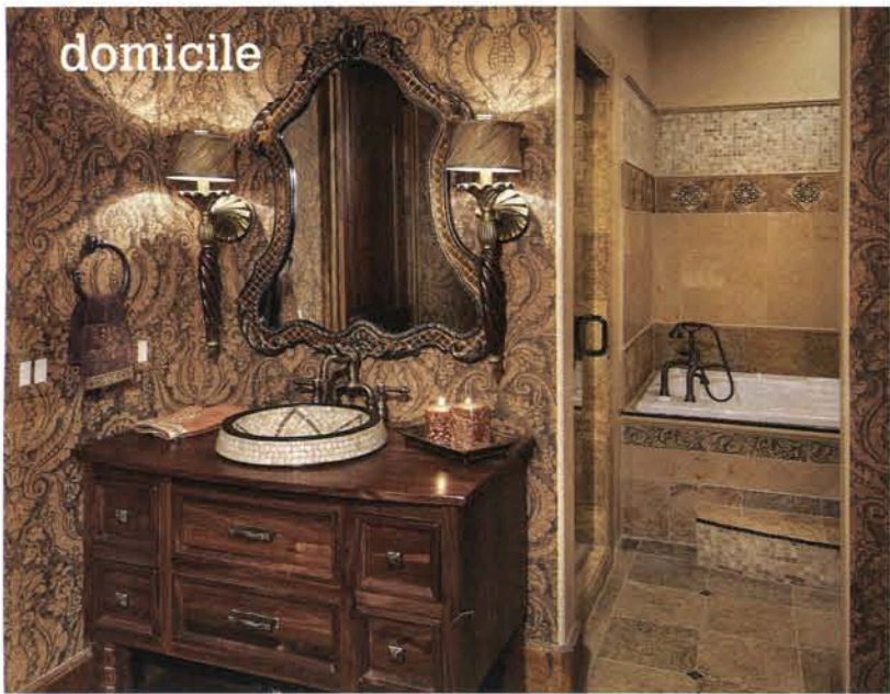
Top left: The lady of the house was inspired by this Apex sink when conceiving her luxurious SPA BATHROOM . Hand-stamped wallpaper by Schumacher adorns the walls, accenting the muted hues of the custom-designed tile by Renaissance Tile and Bath. The finishing touch: an intricate wooden sink vanity created by Coventry Designs and designed by LLA.